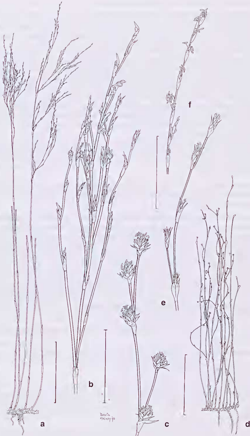
Fig. 3. a–c, Saropsis fastigiata . a, habit (Hind 3217a). b, female inflorescence (Hartley 14290). c, male inflorescence (Constable, 16 Oct 1957). d–f, Guringalia dimorpha . d, habit (Constable 7306). e, female inflorescence (Johnson, 6 Nov 1948). f, male inflorescence (Benson 2358). Scale bars: a, d = 10 cm; b, c, e, f = 2 cm.